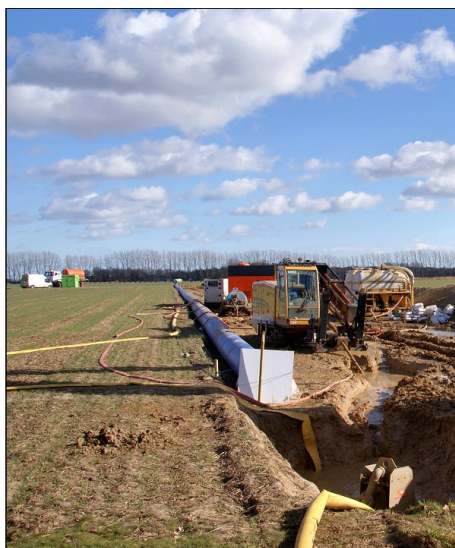
Anglia Water's new Colchester Ring Main as it passes through Langham and Boxted and on to Great Horkesley